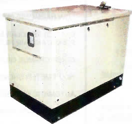
WEATHER, AND SOUND PROTECTED ENCLOSURE FOR OUTSIDE INSTALLATION.